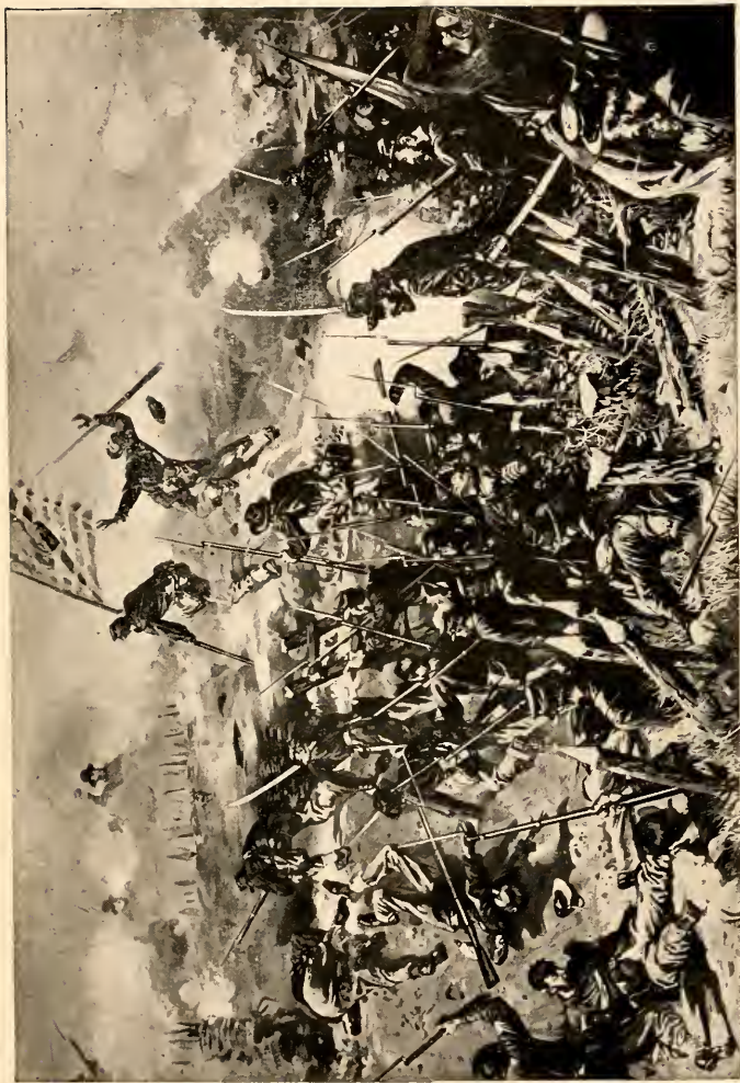
THE ASSAULT ON THE BATTERIES AT VICKSBURG